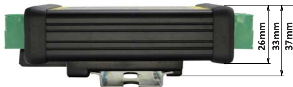
Side view with DIN rail attached