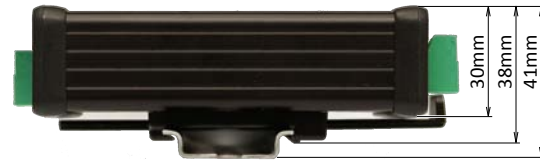
Side view with DIN rail attached